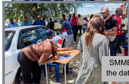
SMMEs who attended got an opportunity to fill the data-base forms before the briefing session.