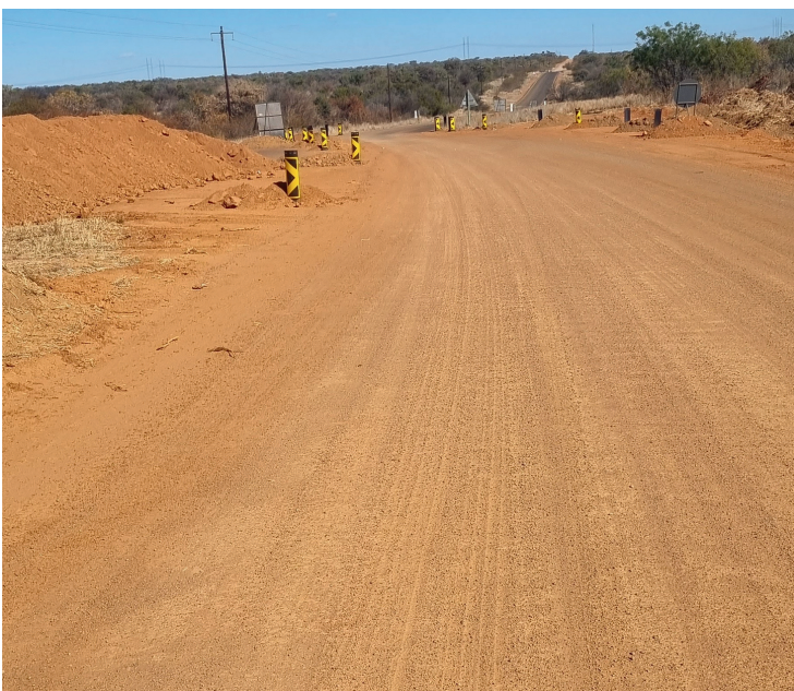
Photo: Road work